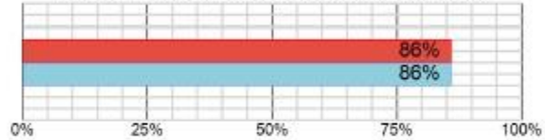
Percent of students who scored at or below your score

National Mean: 65.6% All ADN Programs Mean: 66.1%